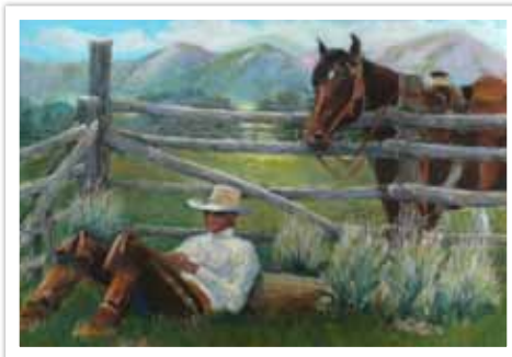
“Taking a Break” Woods Landing, Wyoming, 18 x 24 Pastel