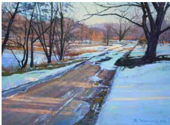
Winter Road by Brian Sauerland, 12" x 16"

Mention in Pastel Journal 2015 Pastel 100 competition.