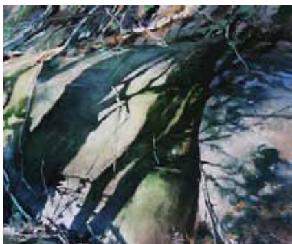
BEST OF SHOW 2013 National Exhibition Moving in Accord , Colette Odyia Smith, PSA, IAPS-MC