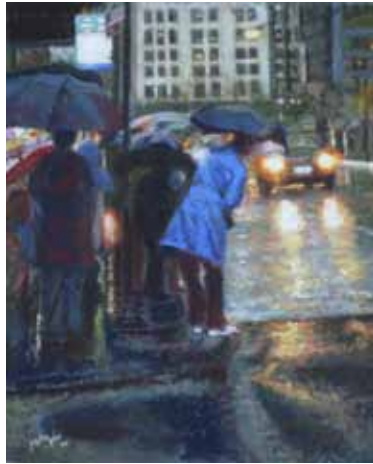
JESSICA FINE Chicago, IL Anxious 15 x 13 $1100