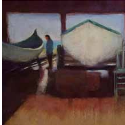
LIZ WALL Palos Park, IL The Boathouse 12 x 12 $500