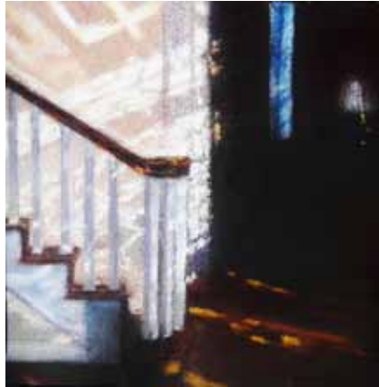
STELLA SOLLIDAY Orland Park, IL Light Patterns 12 x 12 $450