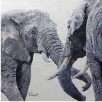
SUE GOMBUS Merrillville, IN Boys Will Be Boys 12 x 12 $1000