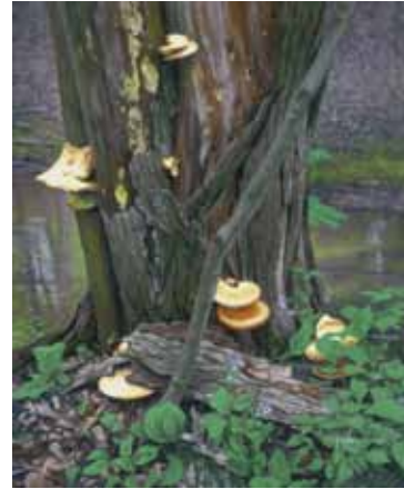
TED FUKA Mokena, IL Fallen Bark 16 x 13.5 $1000