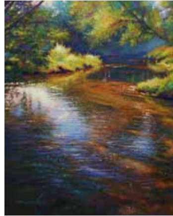
MIKE BARRET KOLASINSKI Chicago, IL Upon Further Reflection 20 x 16 $1200