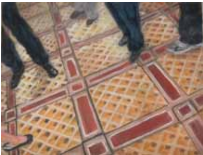
STELLA SOLLIDAY Orland Park, IL Best Foot Forward 11 x 14 $450