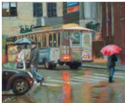
JESSICA FINE Chicago, IL Crossing 14 x 11.5 $1100