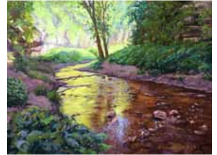
BRIAN SAUERLAND Palatine, IL Radiance 12 x 16 $895