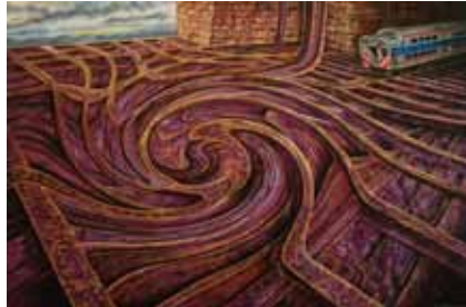
DAVID LEVENSON Chicago, IL Into The City 29 x 43 2400