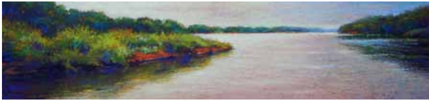
MIKE BARRET KOLASINSKI Chicago, IL FlowEdge 6 x 24 $800