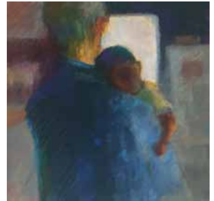
JULIE SKODA Western Springs, IL Content 12 x 12 $1100