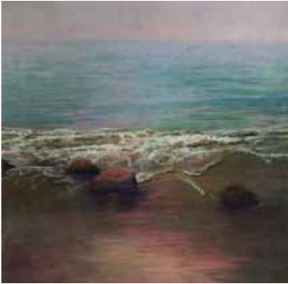
JULIE SKODA Western Springs, IL Rolling In 12 x 12 $900