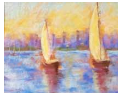
WILL GERMINO Palos Park, IL Dueling Sails 8 x 10 $325