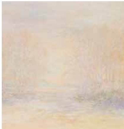
MARIKAY PETER WITLOCK Chicago Heights, IL Water's Edge #40 15 x 15 $1550