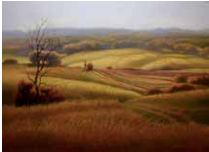
TOM HEFLIN Rockford, IL Galena Hills 21 x 29 $3000