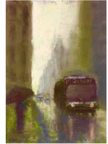
WILL GERMINO Palos Park, IL Michigan Ave Bus 7 x 5 $240