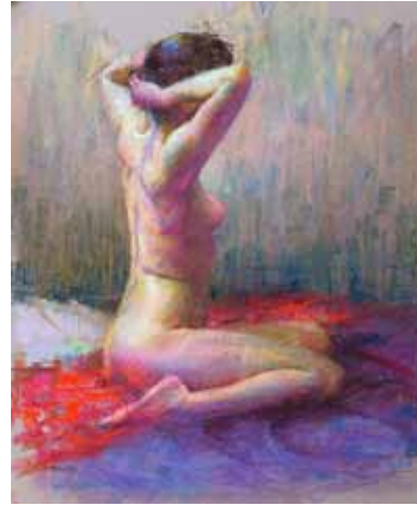
MIGUEL MALAGON Chicago, IL Kneeling 19 x 15 $800