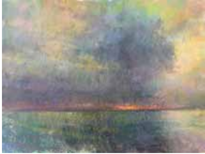
KATHLEEN NEWMAN Palos Park, IL Break 12 x 16 $1200