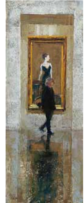
NANCIE KING MERTZ Chicago, IL Moments At The Met – Impressions 21.5 x 8.25 $1490