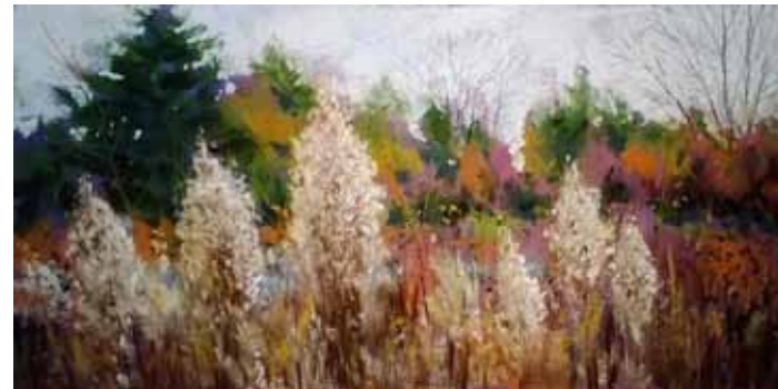
RUSSELL SUP LaGrange, IL Fall At The Arboretum 6 x 12 $600