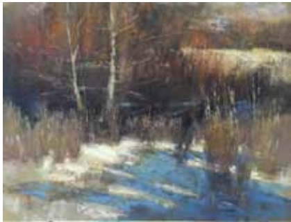
KATHLEEN NEWMAN Palos Park, IL Early Snow 12 x 16 $1200