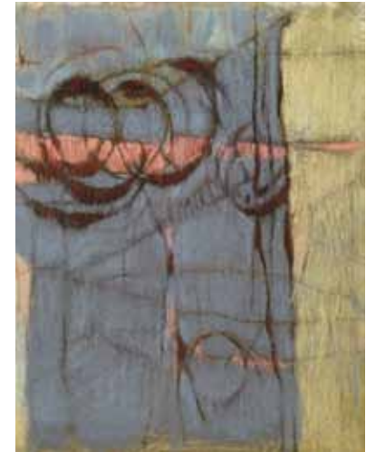
ARLENE TARPEY Glenview, IL Down the Path 2 14 x 12 $500