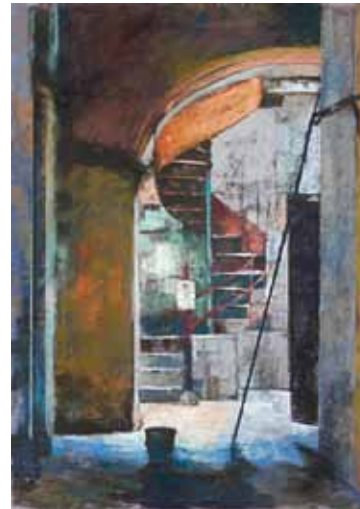
NANCIE KING MERTZ Chicago, IL Cuba's Inner Beauty 42 x 30 $3600