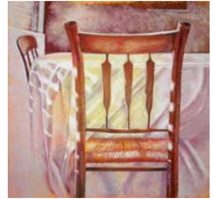
SUSANNE CLARK Viroqua, WI Head of the Table 14.5 x 14.5 $750