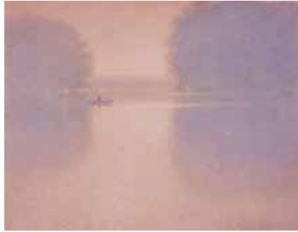
TOM HEFLIN Rockford, IL Whisper Lake 10 x 13 $1500