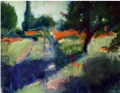
REVEN FELLARS Chicago, IL Poppy Pasture 9 x 12 $350