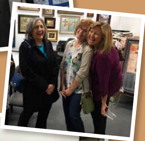
Scenes from the reception and award ceremony of the CPP Strokin' VI! exhibition at Art and Company on September 30, 2016.