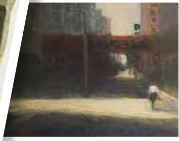
Liz Wall lizwall.com