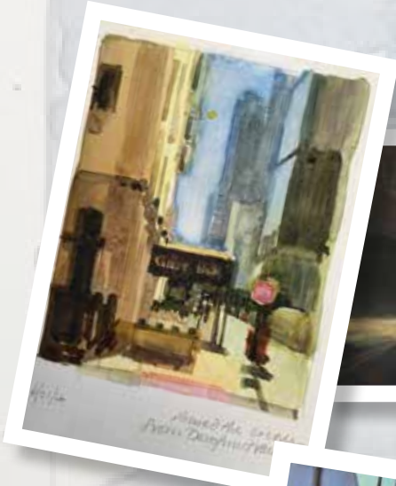
Kathleen Newman kathleennewman.com

2 Weekend Workshops: "Sketch in the City" & "Paint in the City"