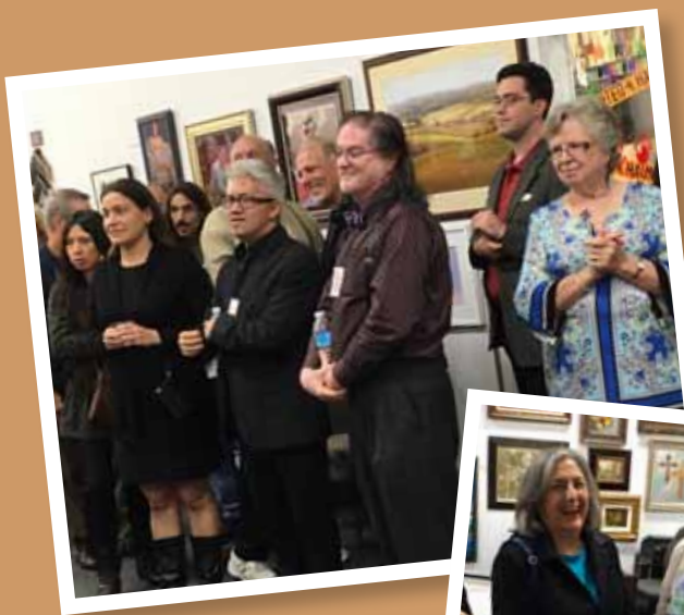
Scenes from the reception and award ceremony of the CPP Strokin' VI! exhibition at Art and Company on September 30, 2016.