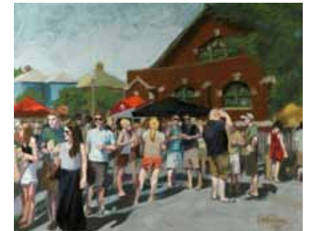
KRISTIN DIVERS Wexford, PA Phoenix Theatre Rising 20 x 16 $800