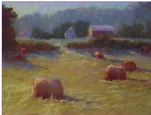
Haybales - Best of Show 2008 - Carol Strock Wasson, CPP

CHICAGO CULTURAL CENTER RENAISSANCE COURT GALLERY FIRST FLOOR, RANDOLPH STREET SIDE 78 EAST WASHINGTON STREET, CHICAGO, ILLINOIS 60602